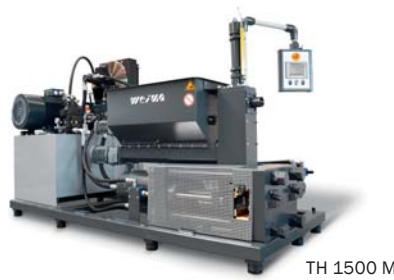
TH 1500 M

SWING ARM PRESS ▶ The briquettes are pressed inside an enclosed chamber with high pressure. This leads to a very high density – without using any binders or additives.