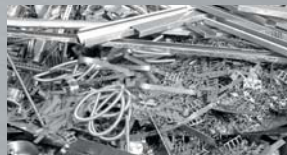
Light metal parts