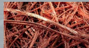
Copper wire and shavings