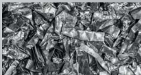
Light metal sleeves